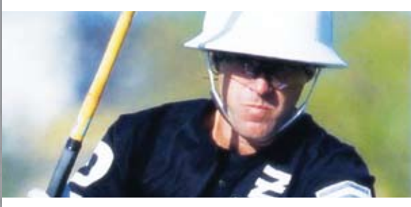
GONZALO PIERES Jr.

Gonzalo Pieres Jr. was born in December 17, 1982 in Buenos Aires, Argentina. He is the eldest son of polo legend Gonzalo Pieres. He is one of the most prominent polo players of the Argentine polo. What makes him a great player is his ability to combine his skills and great passion for the sport together with a more strategic view of the game and a value for the role of each member of the team.