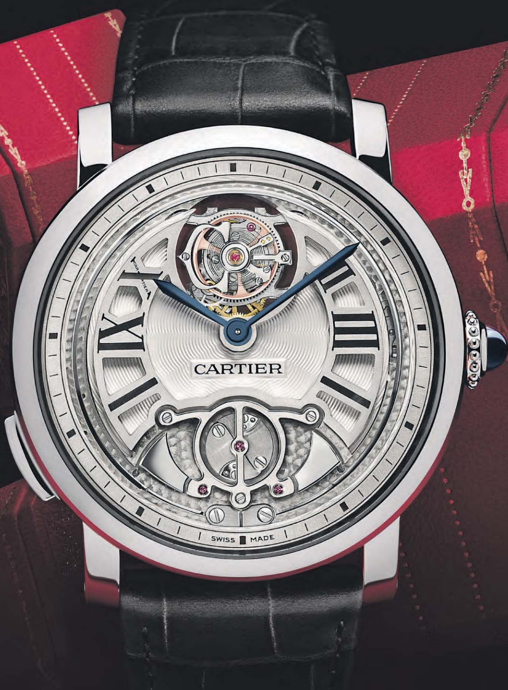
ROTONDE DE CARTIER MINUTE REPEATER FLYING TOURBILLON 9402 MC

CERTIFIED WITH THE GENEVA HALLMARK, THE CALIBRE 9402 MC DE CARTIER BRINGS TOGETHER TWO OF THE MOST PRESTIGIOUS AND COMPLEX HIGH COMPLICATIONS: THE MINUTE REPEATER AND THE FLYING TOURBILLON. WITH A SINGLE PRESS OF THE LATERAL BUTTON THE MINUTE REPEATER ACTIVATES TWO HAMMERS VISIBLE ON THE WATCH DIAL THAT CHIME, INDICATING RESPECTIVELY THE HOUR, THE QUARTER HOUR AND THE MINUTES DISPLAYED BY THE HANDS. THE CHIMING IS REGULATED BY AN INERTIAL FLYWHEEL, VISIBLE AT SIX O'CLOCK, THAT MAKES ALMOST 1000 TURNS A MINUTE. REFINED BY THE ABSENCE OF A BRIDGE ACROSS THE DIAL, THE FLYING TOURBILLON APPEARS TO FLOAT AT THE HEART OF THE WATCH, CREATING A UNIQUE VISUAL EFFECT.