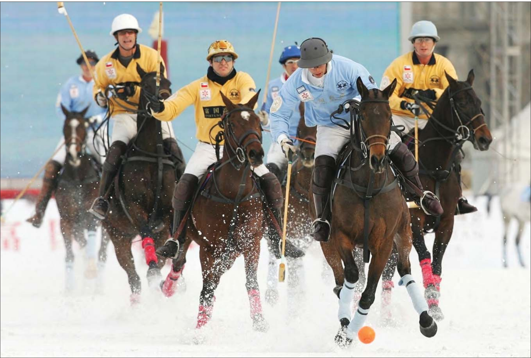
Argentina took on Chile during the recent Snow Polo World Cup, when Tianjin’s Goldin Metropolitan polo club played host