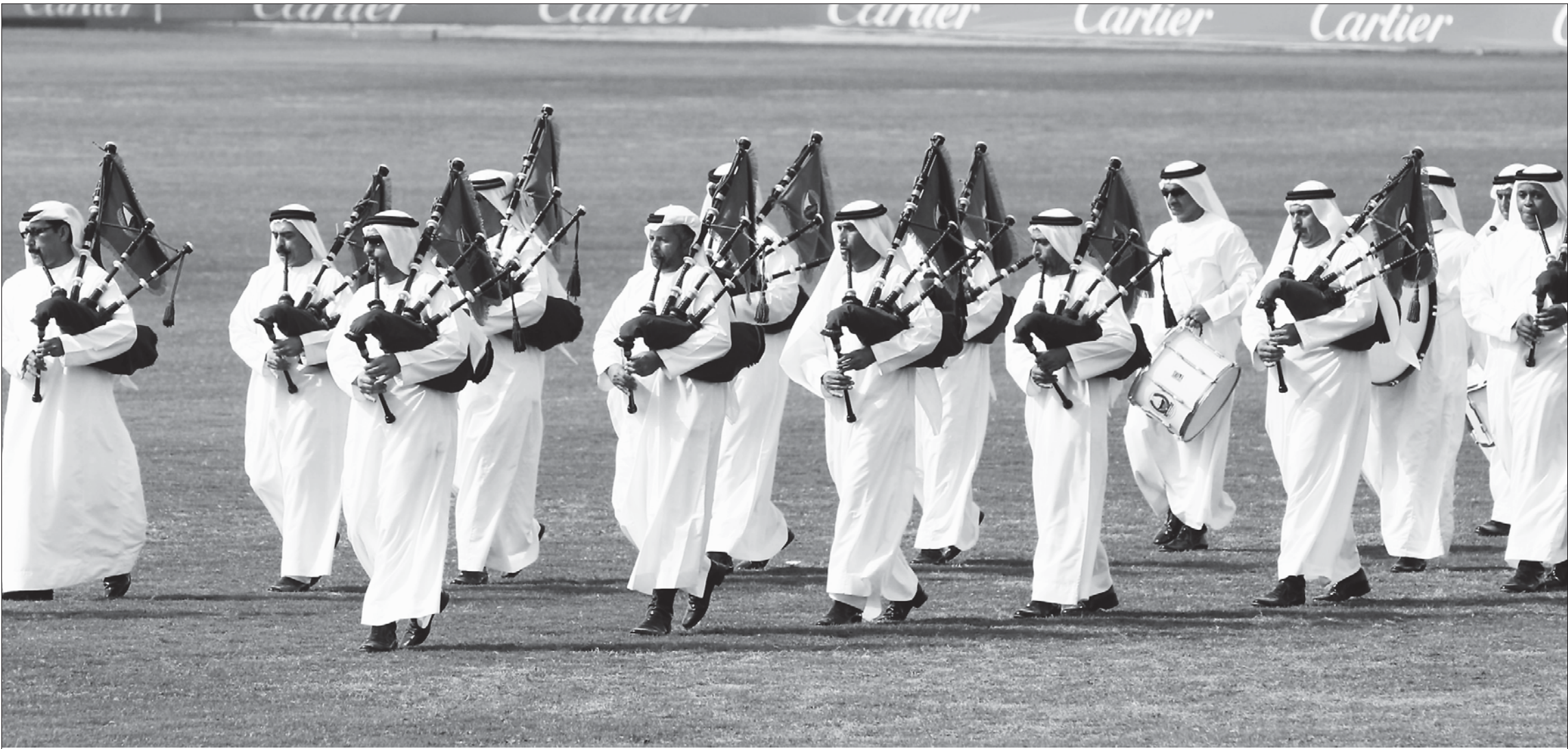
Players in the pipeline: a band performs at the recent Cartier International Dubai Polo Challenge, one of the United Arab Emirates' most prestigious tournaments