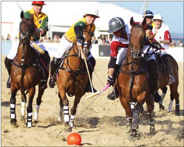
The British Beach Polo Championships at Sandbanks, Dorset