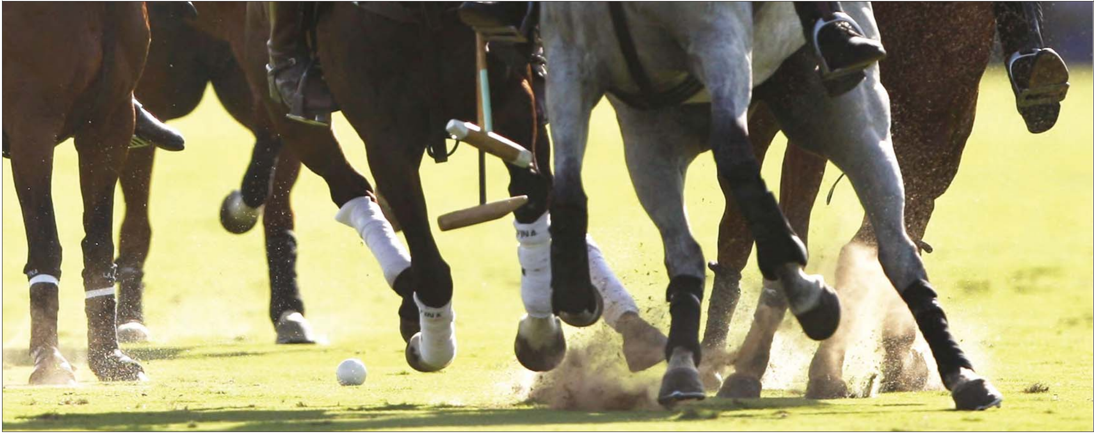
Alterations designed to speed up the game and stop the best players from hogging the ball have contributed to some surprising results