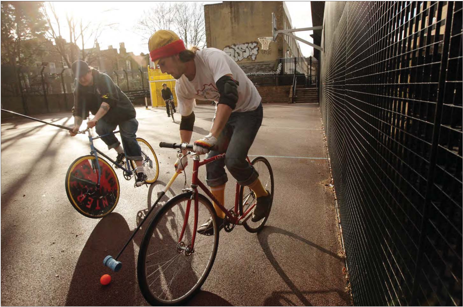
Players from the London Bike Polo League in action at a basketball court in Islington, north London